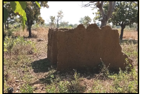
Toilet facilities Before and After

We continue to run our seedbank, plant fruit trees and we have done further sanitary pad projects to help keep girls in school. The director of education for the Wa district has written to us to say how useful this project is. Before the project was introduced girls would miss 5 days per month on average once their periods started, resulting in them often dropping out of school altogether. The retention rate in the Wa district has now risen to 85%, up from 25% for girls starting menstruation, showing that our project is really impacting school attendance. Thank you to everyone who has supported this project. We have helped over 3,500 girls so far and are planning another project for 150 more girls. The initial pilot project for this was paid for by Rotary Club of Skegness - Thank you!